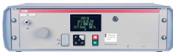
MF520 19"3U CASE